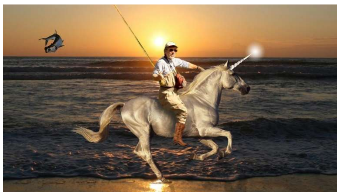
He's Just That Cool