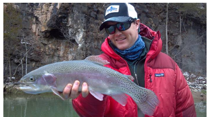
This winter rainbow came from the Watauga River.

Winter fishing in the Southeast isn't what it is in the rest of the country. We are blessed with average lows in the high 20s and average highs in the upper 40s. That still puts average water temperatures in the high 30s and low 40s, unless you are close enough to a dam to