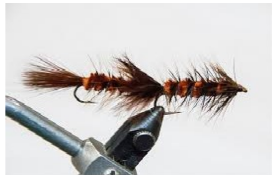
Articulated Woolly Buzzer

Articulated flies such as the Woolly Buzzer shown above have become quite popular due to the live action they present. There are numerous ways to tie them. At the beginning, most were tied to