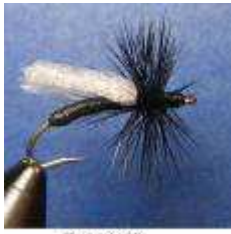
Elk Hair Caddis

caddis for the adult. The elk hair caddis should be tied with a black body and black or gray wing. I particularly like this one tied with a little antron to make it more visible on the water. These flies are quite small and patterns should be tied in a range from 16-20.