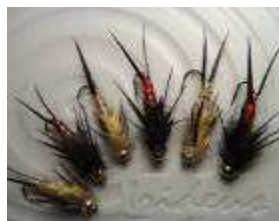
Stonefly Nymph Pattern

The caddis nymph is in the stream year around. There are many good imitations to use, but most importantly, the fly you use should match the size and color of what is in the stream so it is good to turn over a few rocks to see what is there. It is also best to use a weighted fly with a bead head or lead to keep it close to the bottom.