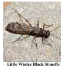
Little Winter Black Stonefly

In this month's newsletter we will continue to discuss what insects the trout in Wilson Creek eat and what we need to cast to fool them into biting. There are five primary groups of insects in Wilson Creek: